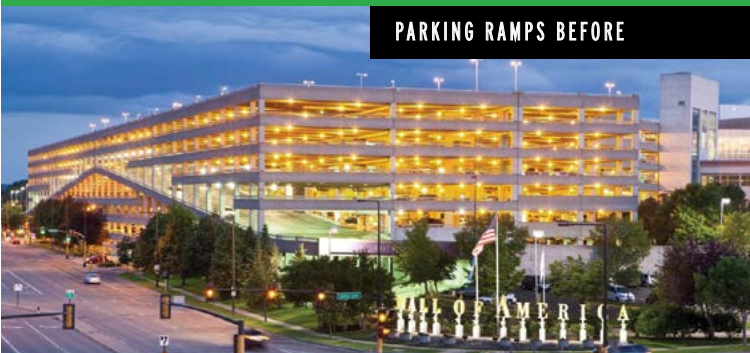
PARKING RAMPS BEFORE